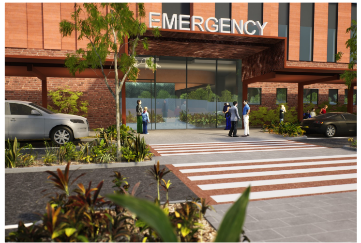
Artist's impression of the new Emergency Department entry.

The Stage 1 hospital tower will include a new and expanded Emergency Department, more than 12 new Operating Theatres, 18 Birthing