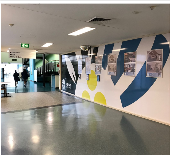
Nepean Redevelopment project wall in South Block at Nepean Hospital.