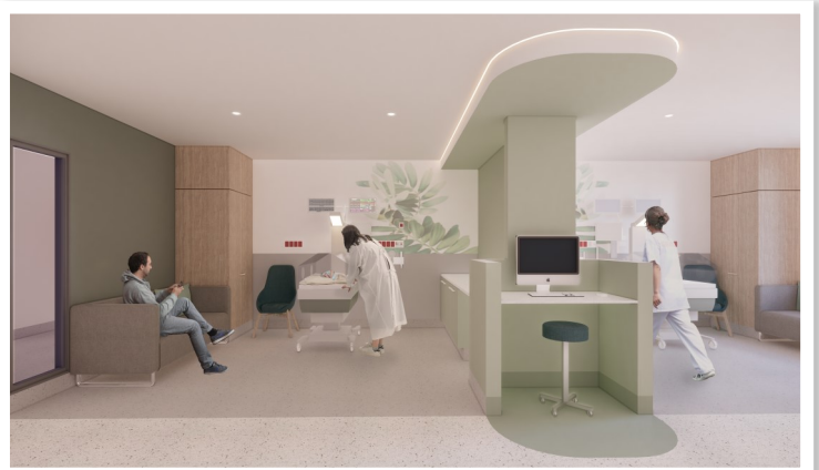
Artist's impression of the Neonatal Intensive Care Unit.