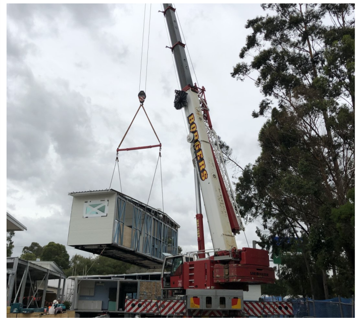
Modular building being lifted into place by a crane on the Nepean Cancer Care Centre work site.

All works are scheduled to be complete in mid-2019, which is a great outcome for patients and staff.