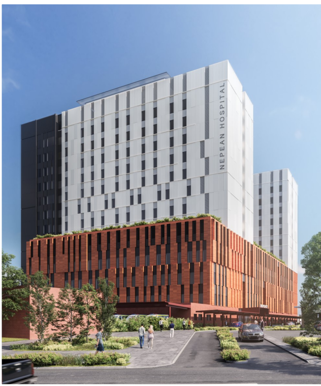
Artist's impression of the Stage 1 hospital tower.

Currently, the project team is also conducting a roadshow to capture community input into the look and feel of the public spaces of the new tower. This will feed into the final detailed design phase. Further details about this roadshow are included on page 4 of this newsletter.